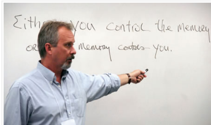
Photo: A VWP Seminar in 2011. Credit: Jacqueline Hames, Soldiers Magazine.